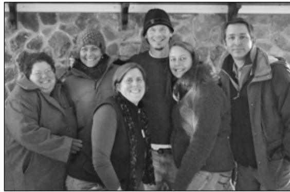
Team Admin gathers for a photo at the Inn on Peaks Island during a winter brainstorming retreat (left). Naturalists explore the tide pools during staff training to prepare for the spring term 2011 (right).